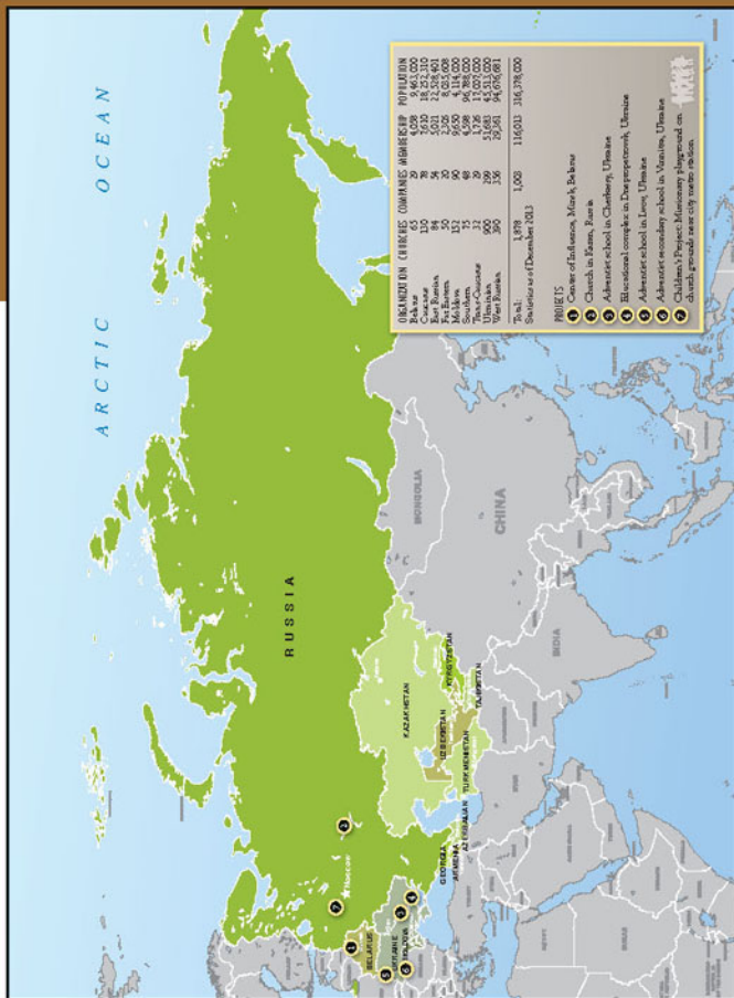
Map and information provided by the Office of Adventist Mission

Where legally possible, offerings will go to their projects, otherwise offerings will be made through the General Conference for distribution of funds based on the best of the counsel where these offerings are received.