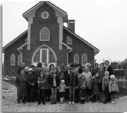
Members celebrate their new church (left) in Temryuk, Russia.

to raise money for a church until the Thirteenth Sabbath Offering helped make their dream a reality. Today a simple church stands in this town in western Russia, a lighthouse and a testimony to the power of many working together as one to finish God’s work.